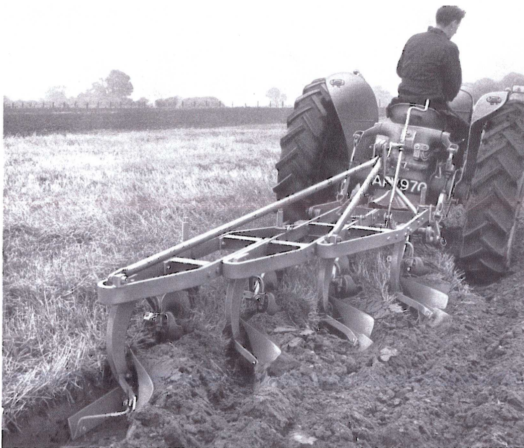
The New TS-73 Plough in Work With Pre-Set Linkage Control

The Pre-Set Linkage Control consists of two assemblies :