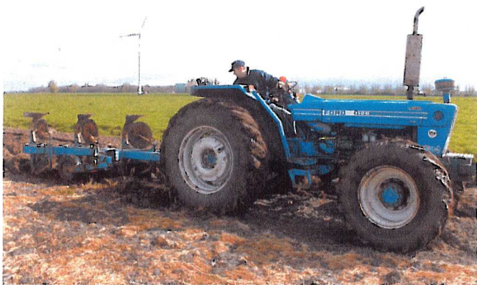
Ford 1186, a six cylinder conversion no doubt carried out by Belgian firm EVA to be sold through the Ford dealer network in several European countries