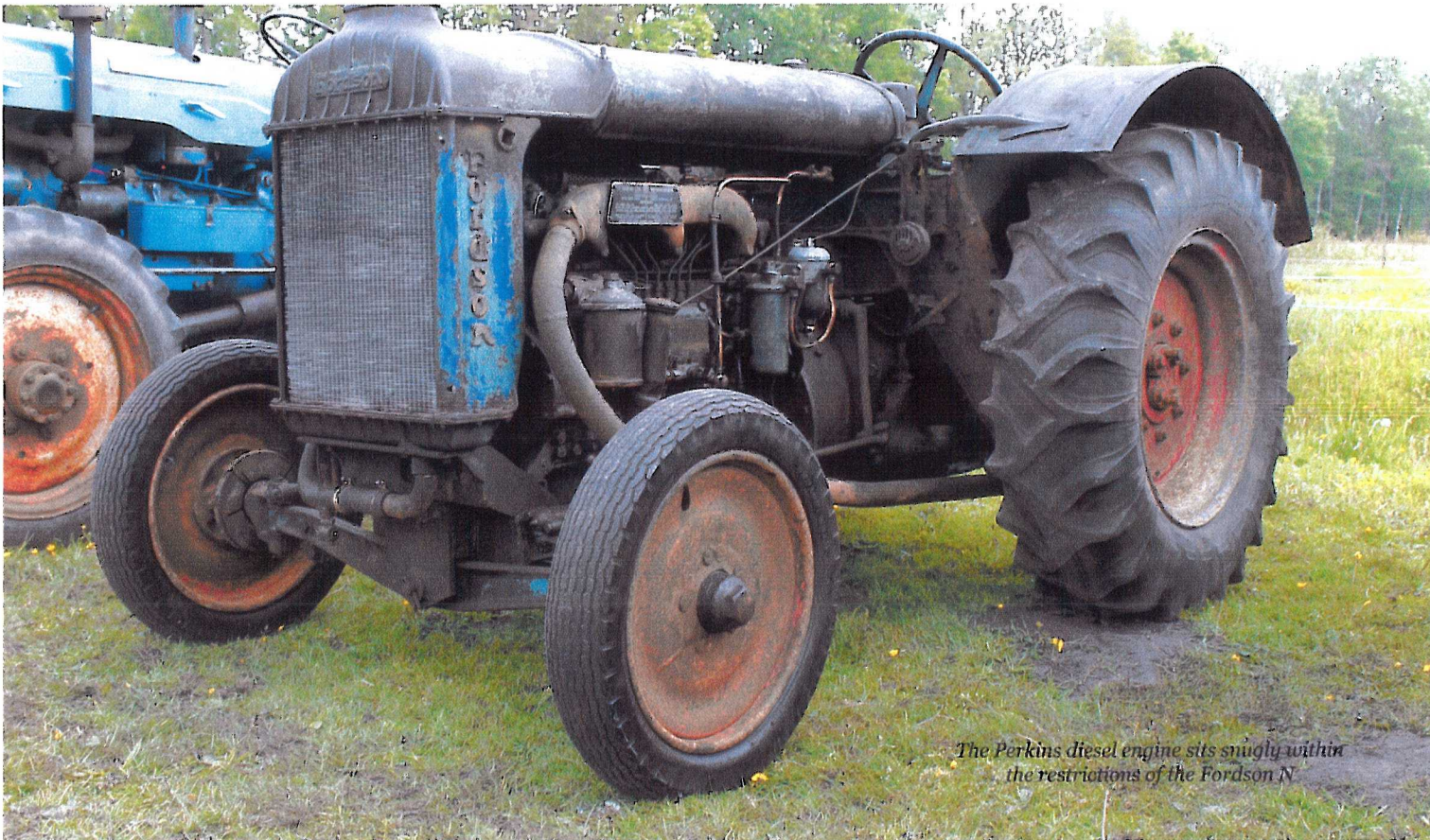
The Perkins diesel engine sits snugly within the restrictions of the Fordson N

The second of the Dutch events was held on Saturday 21st May when no less than four clubs organised a Ford and Fordson day in the northern part of Holland. The clubs involved were the OTMV, LCN, Ford & Fordson Association and the Ford and Fordson Club Netherlands.