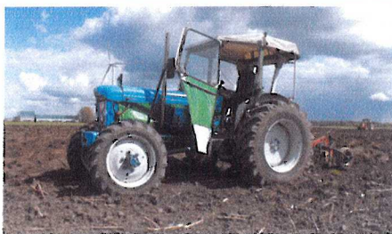
Roadless Ploughmaster based on the Super Major with a Dutch type weather cab