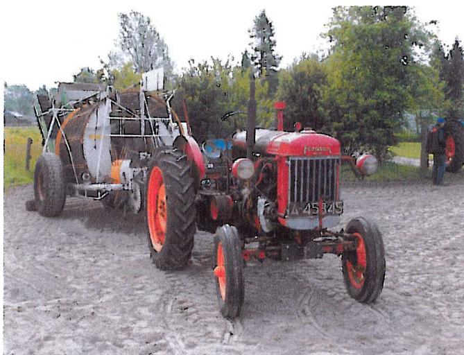
An unusual colour scheme for a Major and the machine on the back looks quite frightening! Is it some type of potato harvester?