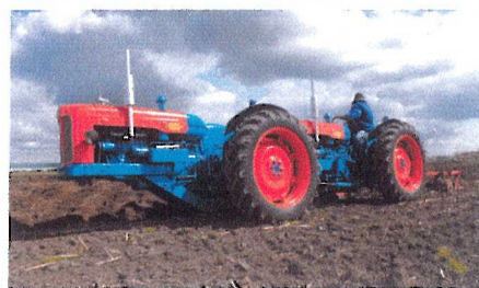
There cannot be that many Doe Triple D tractors in Holland