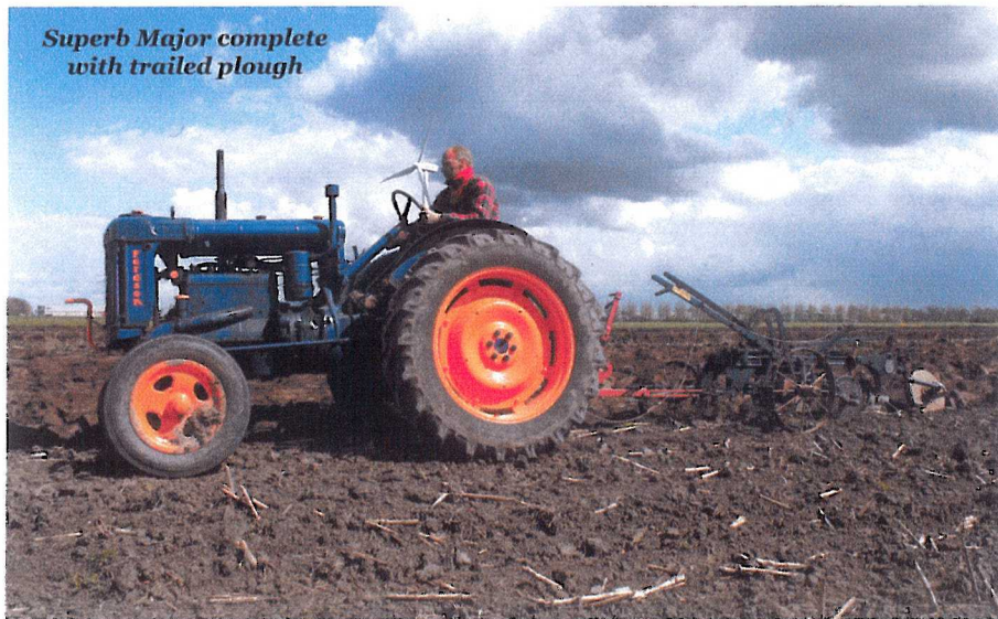
Superb Major complete with trailed plough

We were very pleased to have such a variety of tractors present, from a Fordson N to a Doe and from Majors to several Countys.