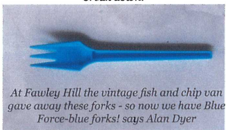
At Fawley Hill the vintage fish and chip van gave away these forks - so now we have Blue Force-blue forks! says Alan Dyer