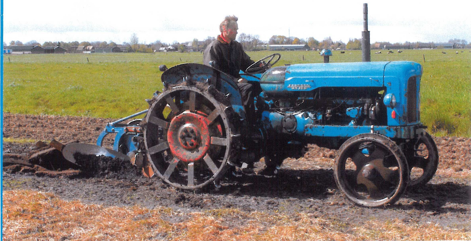
Steel wheels all round add a touch of nostalgia to this Fordson Major as it opens up a corner of the ploughing field