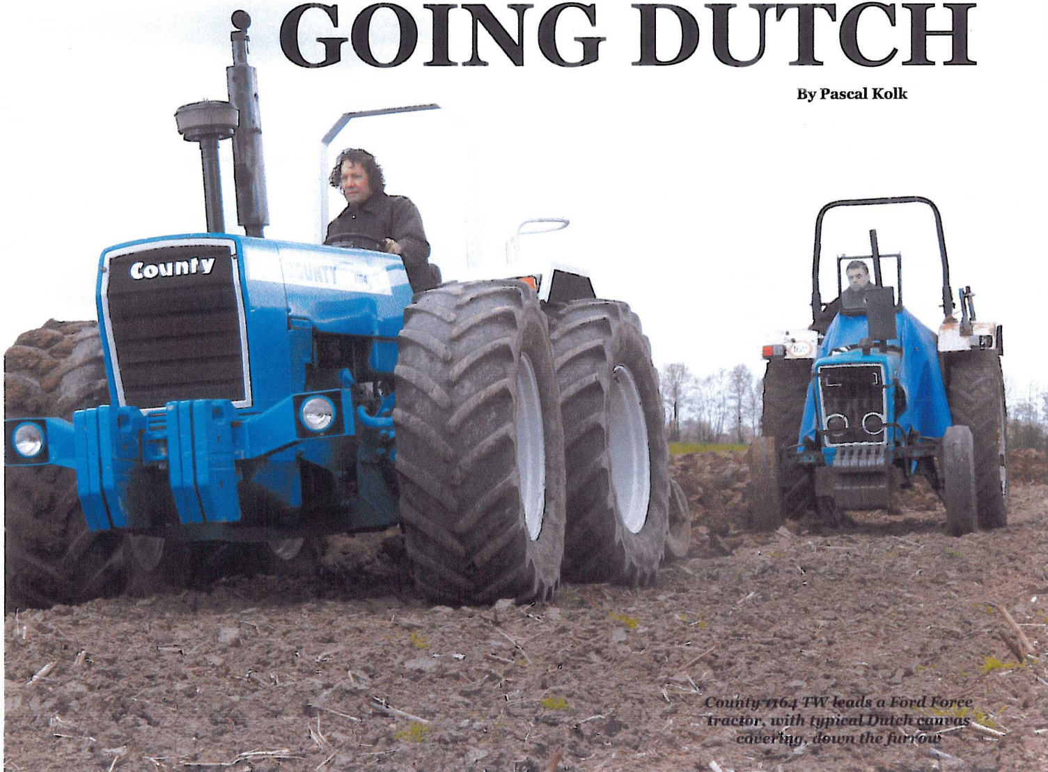
County #164 TW leads a Ford Force tractor, with typical Dutch canvas covering, down the furrow

I n April and May this year two separate events celebrated the Ford tractor and its derivatives in Holland, showing just what a big following the blue machines have in The Netherlands.