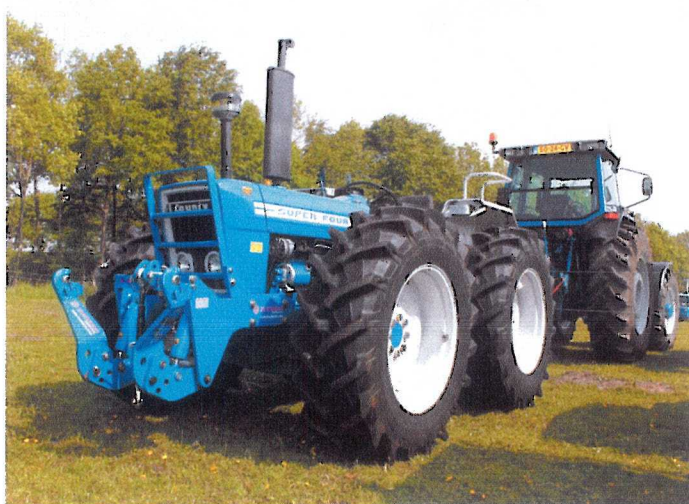
County 754 with a very substantial front linkage fitted and appearing to be a recent restoration judging by the condition of its tyres