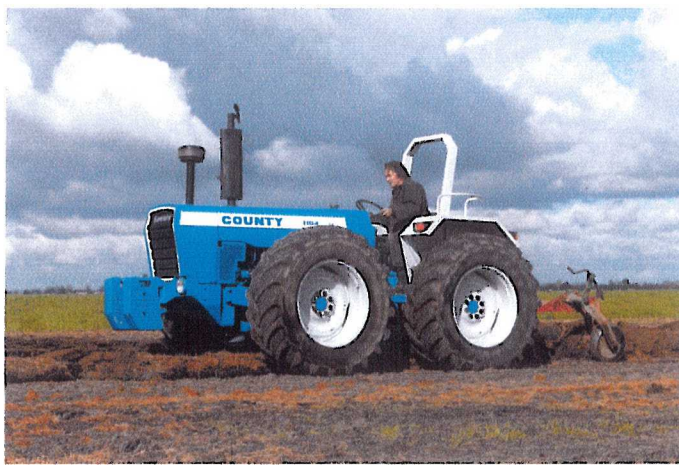
Not a common sight as the County 1164 TW was an export model based on the 1184 TW but with basic specification including an eight speed transmission and open operator platform