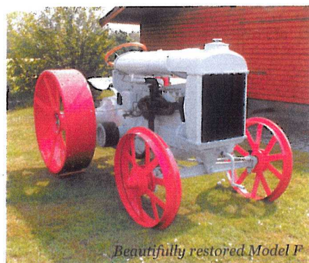
Beautifully restored Model F