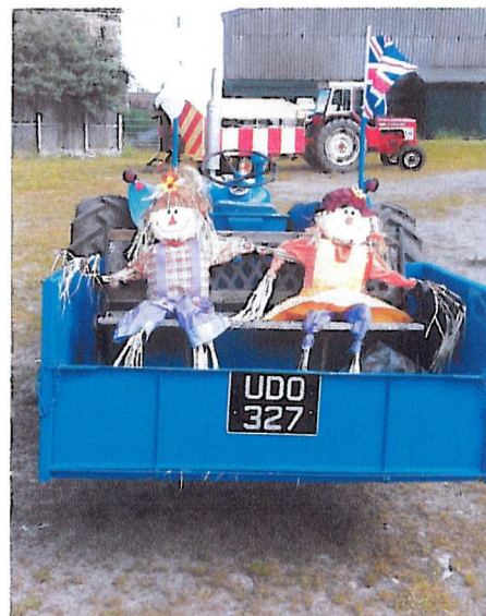
Gary Capp says: Phil and Pete enjoying a road run, cosying up in the back of the Dexta!