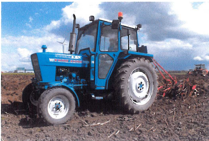
Ford Force 4000 with front mudguards often seen in Europe and a much later Duncan Supercab - which suits it very well