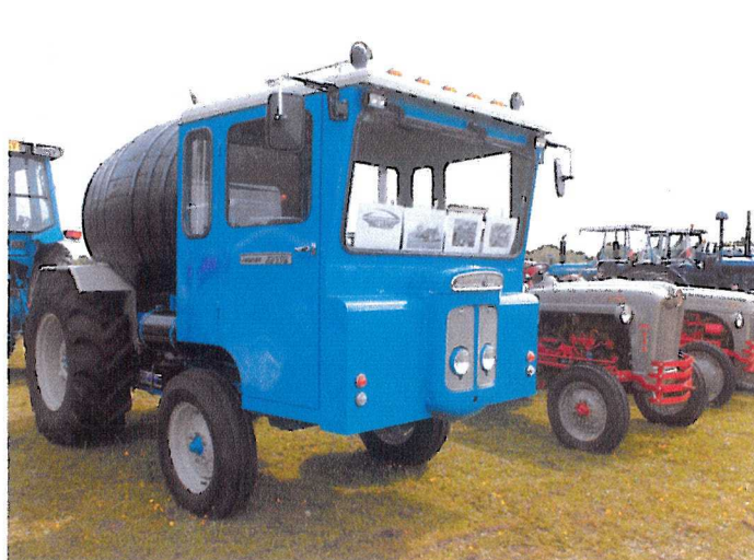
How about this for a conversion? A forward control Super Dextra complete with substantial coach-built cab and what looks like an oversize beer barrel on the rear