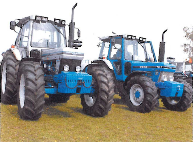
The Ford 7810 needs no introduction but its not often you see two such superb machines as these Generation III tractors together, the standard blue version contrasting nicely with the Silver Jubilee special