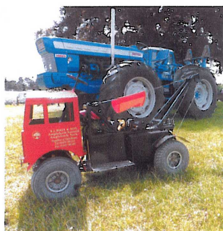
Superbly detailed model wrecker on the stand at Pickering - good job Ford tractors never break down!