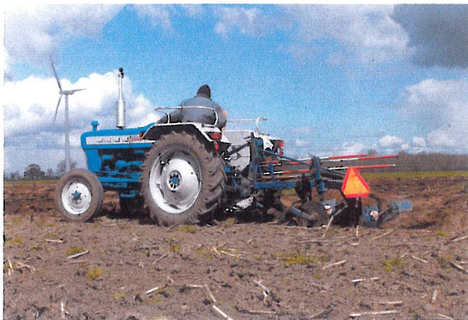
Ford 3000 ploughing away with wind turbine in the background. Turbines have replaced windmills in the Dutch countryside it seems!