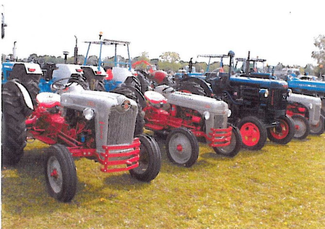
The American tractors from the fifties and sixties always stand out in a line-up with their distinctive styling and red and grey colour scheme. Here a couple of 8N and a 650 grace the row of otherwise blue machines