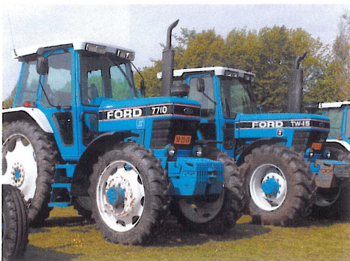
Two members of the Force II range side by side, the 7710 is obviously used for row crop work while the TW-15 beside it is probably used for heavier work - both look in amazing condition