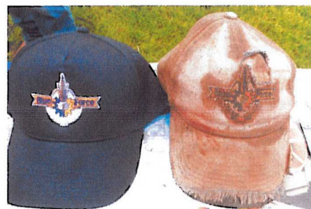
What a well worn and obviously much loved cap - it seems almost a crime to replace it, but we all know how persuasive the team who manage the merchandise stall can be!